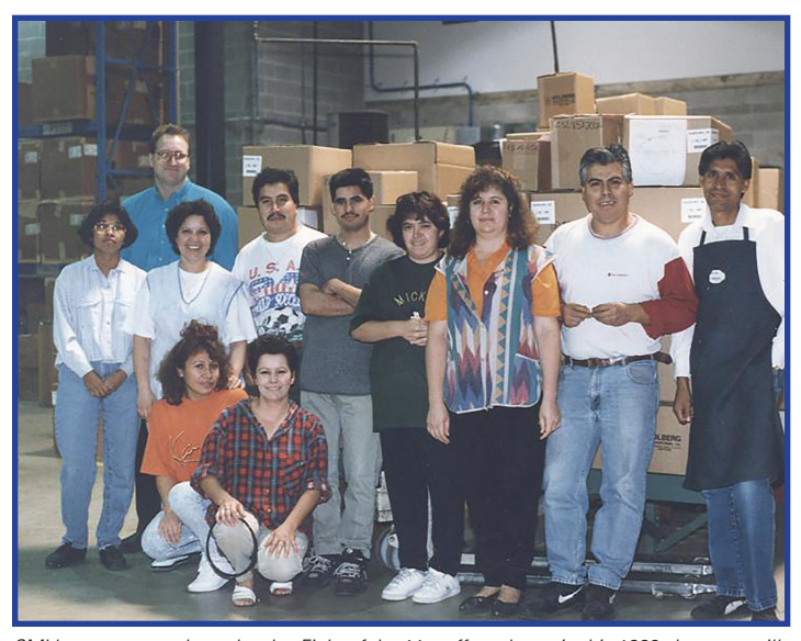
SMI has strong employee loyalty. Eight of the 11 staffers shown in this 1992 photo are still with the company today.

The building renovations at SMI's headquarters met LEED standards and resulted in a healthier workplace due to lower VOCs, multiple HVAC zones for added comfort, and adjustable-height desks.