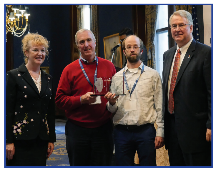
SMI proudly received its second Illinois Sustainability Award in 2018, this time for "continuous improvement."