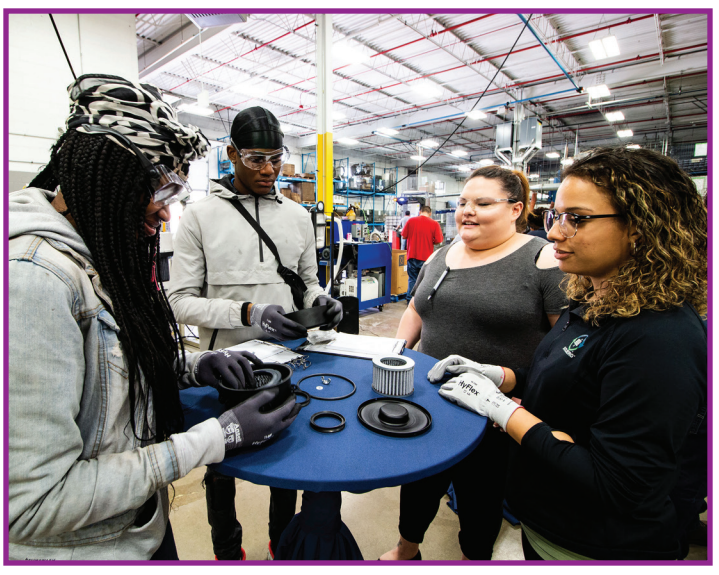
SMI conducted a number of community events to showcase the company while promoting careers in manufacturing.

SMI hosted "Manufacturing Days" for a second straight year, bringing in STEM (science, technology, engineering, and math) students from two area high schools and one afterschool program to learn about manufacturing through plant tours, handson exercises, and career panel discussions. The participating schools were Pritzker College Prep, Harper High School, and an after-school program called Embarc.