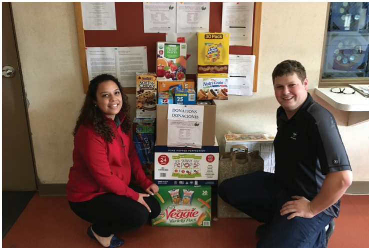
SMI team members helped raise awareness for domestic violence by collecting donations for Sarah's Inn.

For 2017, we will repeat our objective of increasing community service. We know this is essential to delivering value to our communities and following through on our Guiding Principles. We also realize the reward and impact it brings to the lives of those who volunteer.