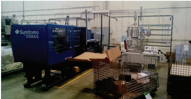
SMI invested in a new injection molder in 2016 to increase efficiencies.

Our gains in efficiencies and production were offset by added energy requirements. Our changing product mix has led to more sales of lower volume, higher cost products that are physically larger. This evolution resulted in higher energy intensity numbers, partly due to flat unit sales coupled with new machinery required to manage the more complex product mix. Also, we chose to move some production processes in house instead of using outside suppliers, to reduce manufacturing times. For these reasons, we were unable to meet our energy intensity reduction goal.